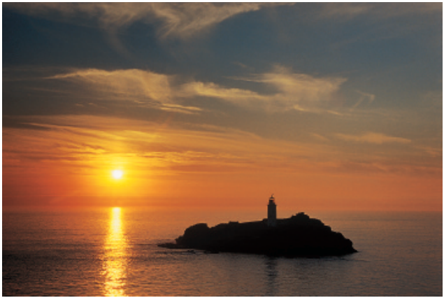
Left: Godrevy Glory