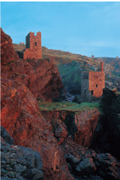
The Crown Mines, Botallack