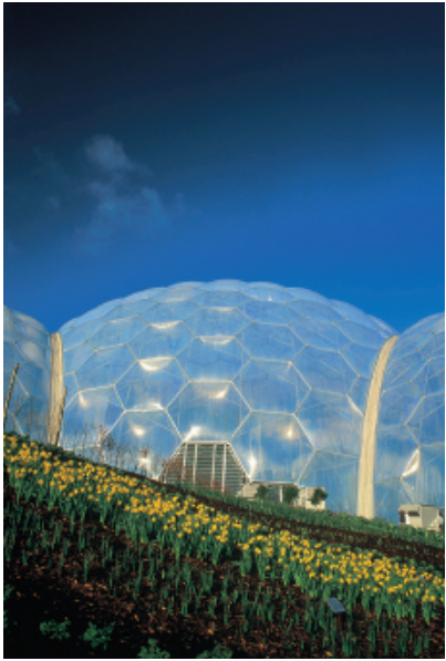
The Eden Project