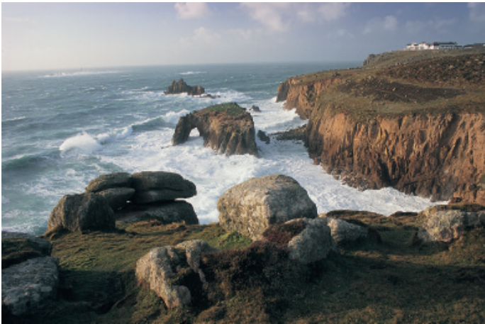
Right: The Enys Dodnan and Armed Knight, Land's End